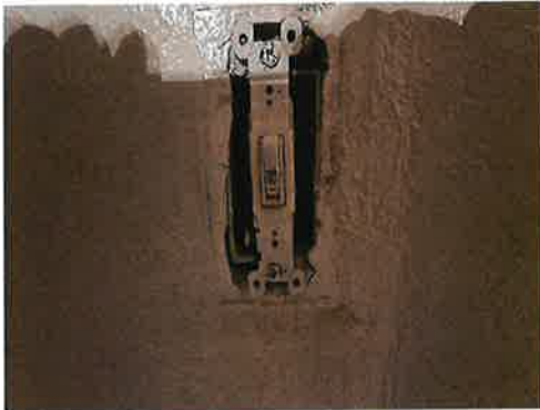
1218-1 Plaster Typical Interior Walls/Ceilings