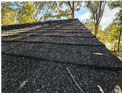
1218-3 Asphalt Shingle/Tar Typical Exterior Roof