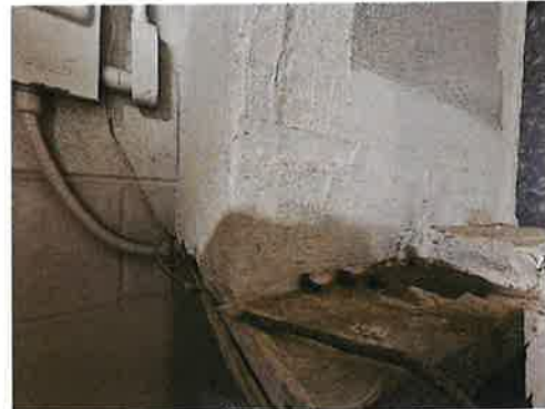
1218-2 Duct Mastic Typical Interior HVAC